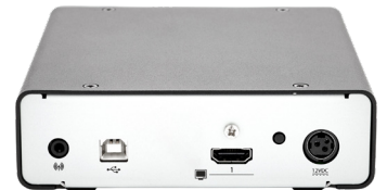
ADDERLink INFINITY 1104 TX - Rear